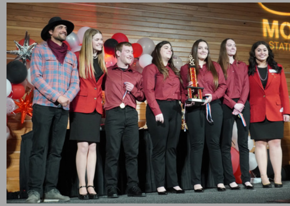
ProStart Management 1st Place: Belgrade 2nd Place: Powell County