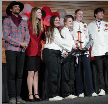
ProStart Culinary 1st Place: Belgrade 2nd Place: Fergus

In conjunction with the State Leadership Conference, the Montana ProStart Invitational was held on March 14. Eight schools competed in the culinary competition, and five in the management competition. Congratulations to the teams placing in this year's competitions!